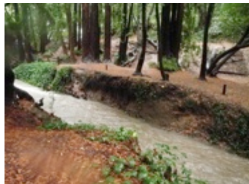
Miller Grove in need of restoration and fish passage barrier removal.