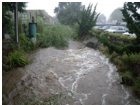
Arroyo Corte Madera Stream Gauge during big storm event October 2010.

In 2010 we surveyed portions of the Arroyo Corte Madera del Presidio (ACM) watershed for Endangered Species Act, threatened Steelhead Salmon. We found 55 of them in 10 pools. The National Oceanographic and Atmospheric Administration, National Marine Fisheries Service (NMFS) is working on a San Francisco Bay Steelhead Recovery Plan where this data was entered. Though we have an urbanized system, there is still plenty of viable habitat according to the 2009 California Department of Fish and Game ACM 2009 Habitat Assessment Report. If we are to continue to support these evolutionarily significant steelhead we must work together, with the community, to understand and begin to remove impediments to biologic functions. We need your help. Please volunteer with us to protect these magnificent fish and other riparian species for future generations. We all live in a watershed.