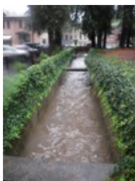
Channelized creek: loss of fish habitat.