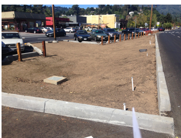
Work on Miller Avenue's rain garden.