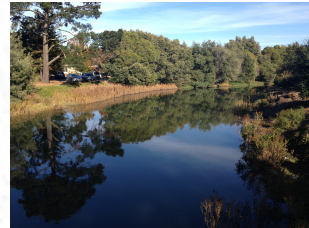
Do you recognize these views of the watershed? L to R: Old Mill Creek, Sutton Manor Creek, Richardson Bay, and Arroyo Corte Madera del Presidio Creek.