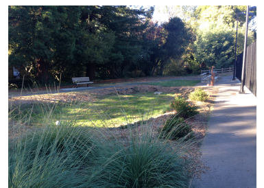
Boyle Park's rain garden will slow runoff.

Led tour about Mill Valley's streams with City Council member and Director of Public Works.