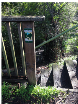
SLPs were at issue this year.

Led work party to remove invasive Carex pendula along Old Mill Creek in Old Mill Park.