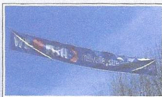
MVSK's We love fish banner!