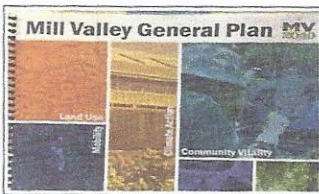
MV 2040, adopted in 2013

Created and mounted display "Protect & Restore our Watershed" in the Mill Valley Library case.