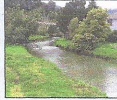
Urban Wildlife Corridor