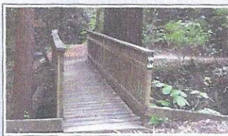
A nicely marked, inviting Zig Zag Trail.