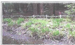
Invasive weed Carex pendula